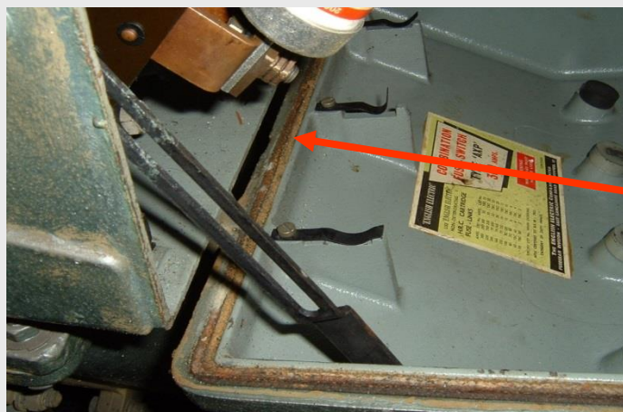
Asbestos rope door seal

There are various types of maintenance tasks that are undertaken that may interact with the ACMs in signalling equipment housings / REBs / Relay Rooms. The tasks could include Cleaning and measuring voltages, maintenance of equipment containing ACMs, maintenance to assets that are attached to asbestos boards, installing/removing/repairing services, general building repairs, removal of flaking paint/coatings that contain asbestos or are on an asbestos material.