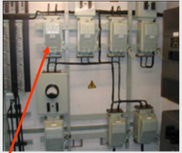
Fuse Box/Switch Gear, Fuse Shields/Flash Guards – Asbestos Cement